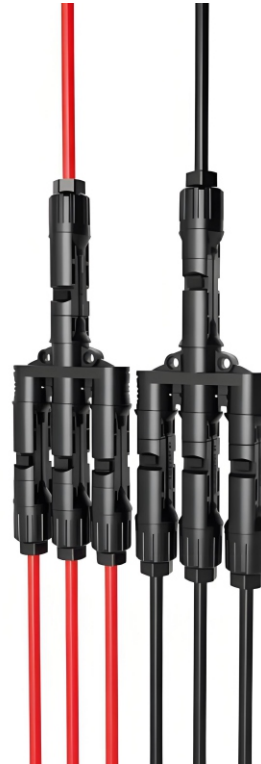
错误布线示意图 Incorrect wiring diagram

禁止连接器悬空吊着使用 Prohibit the use of connectors with dangling (unterminated) ends