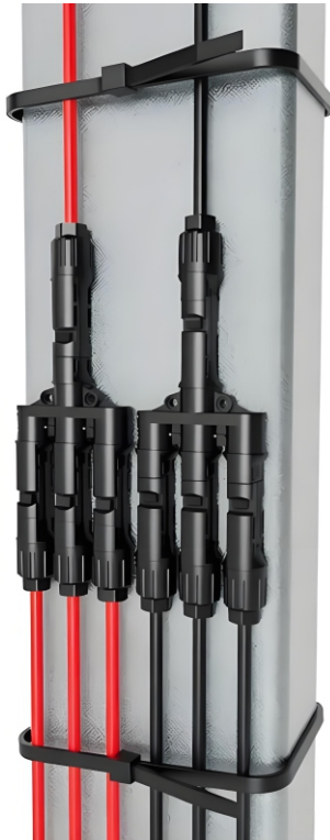
正确布线示意图 Correct wiring diagram

使用连接器时请使用扎带或线码来固定 When using connectors, employ cable ties or wire clamps for fixation